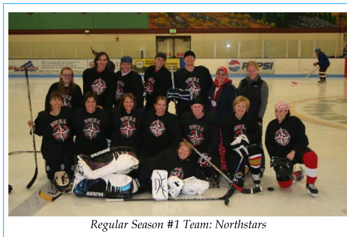
Regular Season #1 Team: Northstars

The DWHL Fall Mixed league regular season has just finished, with the top three seeds changing dramatically on the last night. When the final game started, the Jets led the league, followed by the Stingers, with the Northstars one point back in third place. However, after a hard fought, close game, the Northstars defeated the Jets and jumped from third to first place!